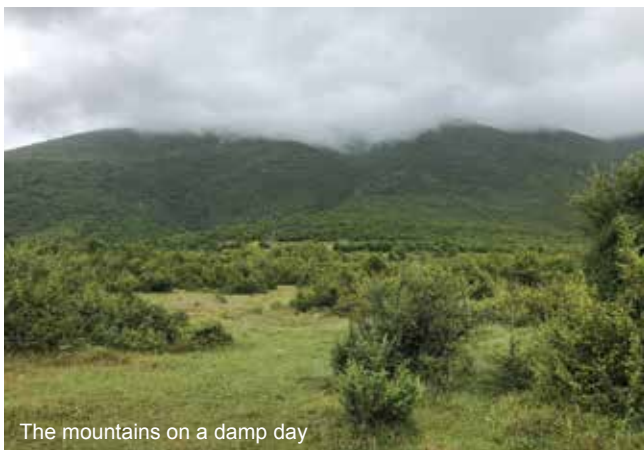
The mountains on a damp day

Tommy has recently returned from a sneak preview of the 2018 crop in Macedonia. Although we are still 2-3 months away from the harvest a visit at this time of year helps to forge a plan with our collectors and provides an insight of what we might expect from the 2018 crop.