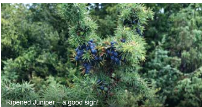
Ripened Juniper – a good sign!