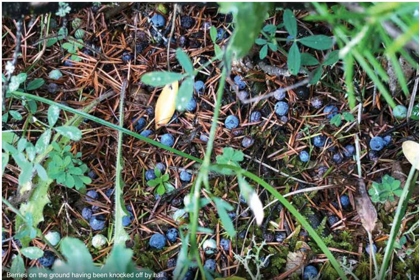
Berries on the ground having been knocked off by hail