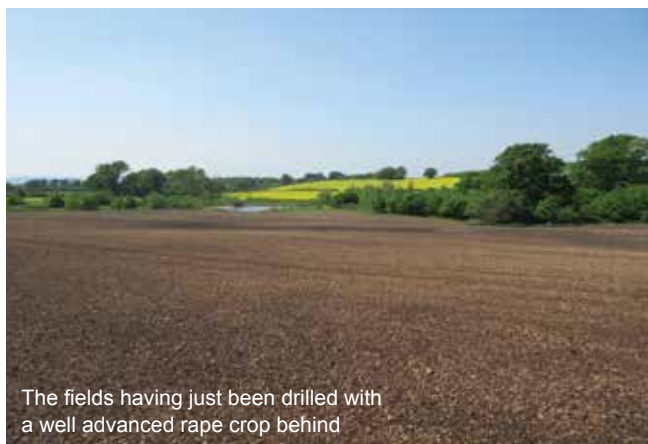
The fields having just been drilled with a well advanced rape crop behind

After two good years, we struggled with achieving a satisfactory yield from the 2016 planting of our English Coriander Crop in Sussex. Similarly to many spring drilled crops, our English Coriander struggled with the early spring weather with large parts of the fields being washed away by floods.