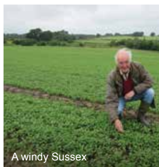
A windy Sussex

We have also concluded that these deluges of rain affected the yield of the coriander in the remaining parts of the fields as the germination and growing were badly stunted at a critical time leaving far fewer seeds on the heads than expected when the flowers turned to seed.