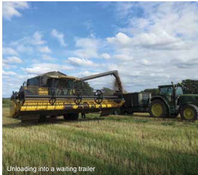
Unloading into a waiting trailer

On a more positive note, we were once again amazed by the number of honey bees that were attracted to the crop during flowering. We have made a conscious decision not to apply any pesticides, herbicides and fertiliser to the coriander during this time and feel that this will have only benefited the bees at this time.