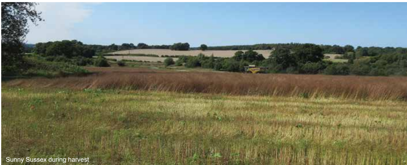
Sunny Sussex during harvest

We would be delighted to hear from you if you feel you may have interest in acquiring a particular quantity (subject to sample approval) of the 2016 as supplies are short. We do hold some carry over stock from the 2015 Crop as well. Please contact Tommy on 01273 844264 or email tommy@beaconcommodities.co.uk .