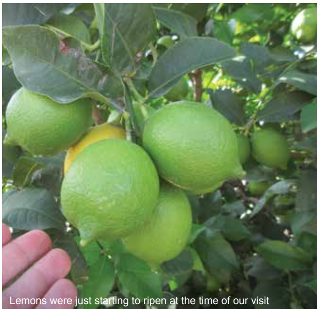
Lemons were just starting to ripen at the time of our visit