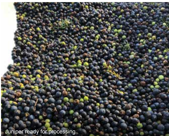
Juniper ready for processing

We hope the above provides a useful insight but if you have any further questions then please do not hesitate to contact us.