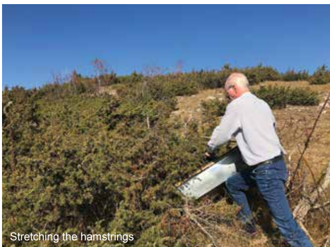
Stretching the hamstrings