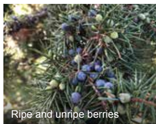
Ripe and unripe berries

We have seen a mixed spectrum of quality but on the whole signs are positive. As with every Juniper crop, great importance is placed on the processing and specifically the drying.