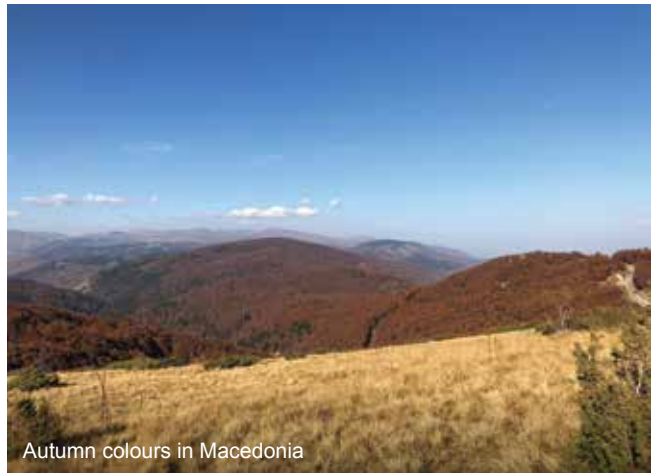
Autumn colours in Macedonia

Quantities have dropped significantly compared to the 'glut' of 2017 but are nowhere near the disastrous levels experienced in 2016. A relief for Tommy's grey hair count (but all too late for Michael's). In 2017, many areas were being harvested more than once as there were large quantities of berries all ripening at different stages. This is not the case this year with collectors harvesting once and then moving into different areas.