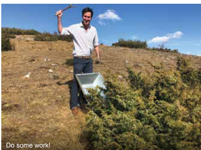
Do some work!